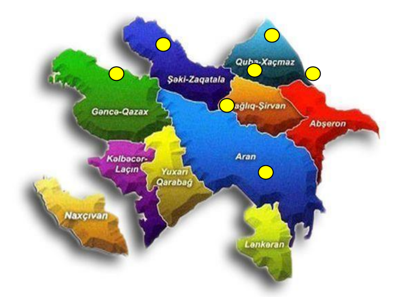
Figure 2.1. An overview of the sample areas ( \bigcirc ) for the study

Essential oil plants in the cultural and wild flora of Azerbaijan and their mycobiota were selected as the object of research, and for this purpose, samples were taken from the territories of seven ecologically different economic regions of Azerbaijan (Absheron, Aran, Guba-Khachmaz, Ganja-Gazakh, Sheki-Zagatala, Lankaran-Astara, and Mountainous Shirvan) (Fig. 2.1). The economic regions sampled for the study differ from each other in terms of the total area of their territory, natural and climatic conditions, as well as the natural resources of the area, vegetation, the nature of the economic activity, and other criteria, and these differences were also taken into account during sampling.